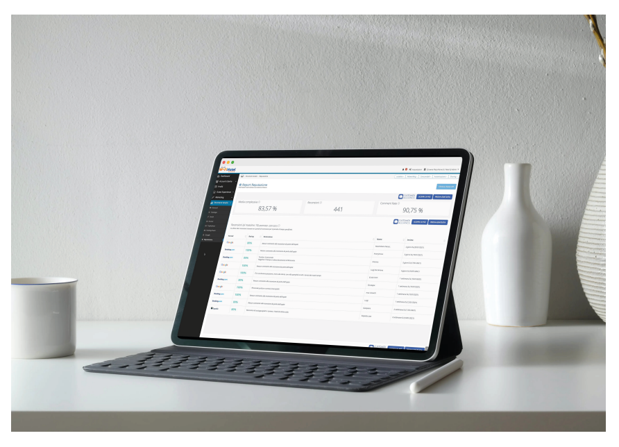
Automations and reputation management