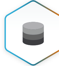
DATA CONNECTION STORAGE