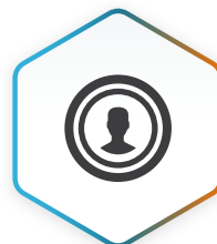
CREATION OF VARIOUS PROFILES