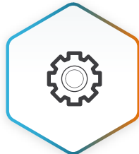
NOMADIC ACCESS AND ZERO CONFIGURATION