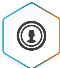
VIEW THE CONNECTED USERS IN REAL TIME