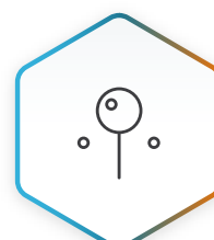
UP TO 200,000 CONNECTIONS