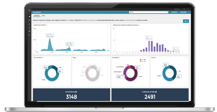
CONTROL TOWER: THE INTUITIVE AND POWERFUL DASHBOARD BY WEBLIB!

Once your customers are connected to the in-store Wi-Fi via their favorite social medias, they are delivered personalised content based on their profile information such as targeted coupons, loyalty programs and satisfaction surveys.