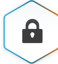
MANAGEMENT OF ACCESS RIGHTS