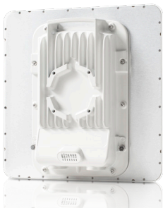
PTP 550 is a Point-to-Point Gigabit throughput solution that operates in the 5 GHz wireless space, addressing the need for high-speed backhaul solutions.