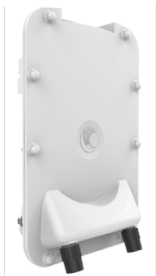
PTP 550 Connectorized (above); PTP 550 Integrated (below)