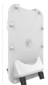
PTP 550 Connectorized (above); PTP 550 Integrated (below)