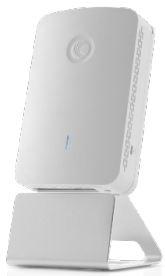
The cnPilot e430 enterprise Indoor Wall Plate AP supports 802.11ac Wave 2 standards based beamforming.

NEIL TUNNICLIFFE, DEPUTY HEADTEACHER, ST. JOHN'S PRIMARY SCHOOL