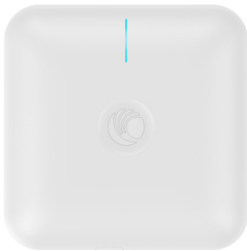
The cnPilot e410 enterprise AP uses 2x2 MU-MIMO and packs a maximum transmit power of 25 dBm.