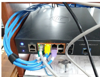
cnMatrix EX2010-P simplifies network operation with zero-touch switch deployment.

MAX THALHAMMER, STUDENT, BETH TIKVAH CONGREGATION