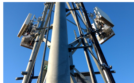
Narrow beams created in MU-MIMO mode increase coverage and throughput while reducing the system’s interference.