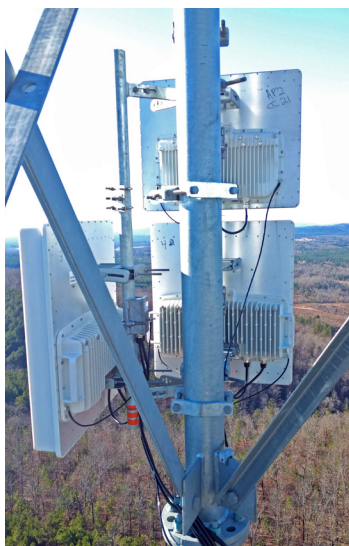
The PMP 450 platform provides high-performance, cost-effective wireless broadband connectivity.