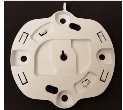
AP Mounting Plate (front) This side faces the AP