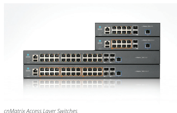
cnMatrix Access Layer Switches

The innovative Policy Based Automation (PBA) functionality on the upstream cnMatrix can also be used to support zero-touch configuration for any wireless device. Automatic detection of Cambium Networks wireless devices is natively supported by PBA. General device characteristics can be specified as well to facilitate automated detection of devices from any vendor. Following device detection, a plethora of actions can be initiated - from auto-segmentation via VLAN creation and port membership assignment to establishing the appropriate default Quality-of-Service (QoS) settings for the discovered device. cnMatrix streamlines and simplifies configuration of a secure and maintainable switching infrastructure.