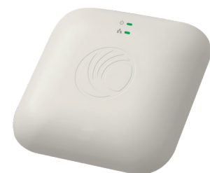
cnPilot Enterprise Access Point

cnMatrix pushes the automation envelope even further with built-in Intelligent Power over Ethernet (PoE). With Intelligent PoE, cnMatrix can auto-detect the PoE requirements of certain connecting devices, in addition to providing complete hands-on control over all PoE functionality. cnMatrix switches support the different requirements of both IEEE-standard active PoE and non-standard passive PoE. cnMatrix will support 802.3af/at/bt PoE as well as 24V and 54V passive PoE. cnMatrix PoE management provides the ability to control per-port PoE status settings and monitor per-port PoE statistics such as voltage, current and instantaneous power being supplied.. This is yet another cnMatrix wireless-aware tool in the arsenal for troubleshooting and diagnostics.