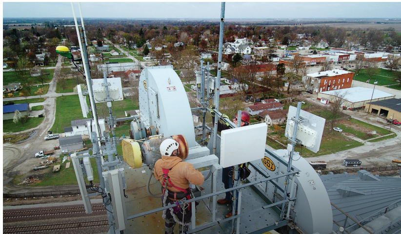
Fixed Wireless Broadband Distribution

Being wireless-aware does not stop with just cnPilot APs. Cambium Networks' outdoor fixed broadband wireless wide area network portfolio also takes advantage of the wireless-aware cnMatrix. Network operators can connect two Cambium radios configured to operate on the same spectrum. The wireless-aware cnMatrix, leveraging proprietary signaling, will appropriately configure the solution to operate in an active-standby mode thereby providing much needed redundancy and maximizing the use of very limited spectrum. It should go without saying that this solution will auto-fail-over if needed, providing for uninterrupted uptime for users.