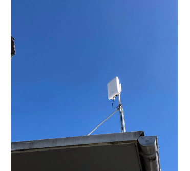
cnPilot™ e500 Outdoor APs provide increased capacity and coverage.