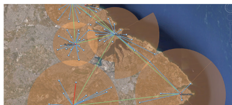
GOOGLE EARTH NETWORK VIEW