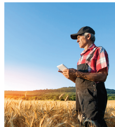
WIRELESS INTERNET SERVICE PROVIDER