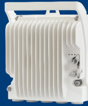
PTP 820C All-Outdoor / Multi-Core