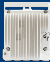
PTP 820S All-Outdoor