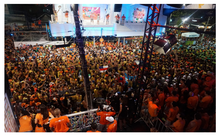
The crowd at Carnival