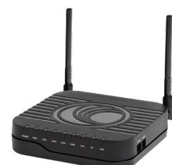
R201 Series: R201, R201P, R201W

Single band 802.11n routers with ATA and/or Cambium PoE options