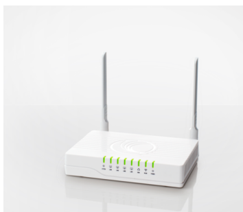
R190 Series: R190V, R190W