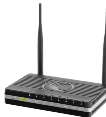
R200 Series: R200, R200P

Single band 802.11n routers with ATA and/or Cambium PoE options