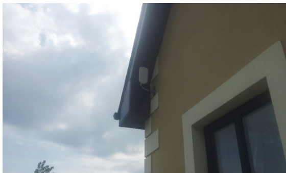
ePMP Subscriber Module on Residence

RocketBroadband needed a low cost solution that was scalable to support growth while providing excellent service to demanding business and residential subscribers.