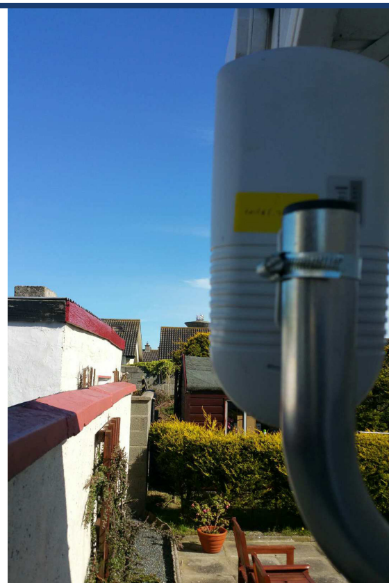
ePMP Subscriber Module