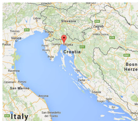
Croatia map