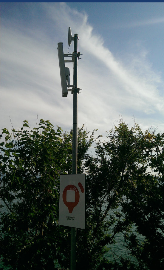
ePMP backhaul and Access Point