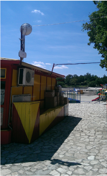
ePMP module with passive reflector connects a residence