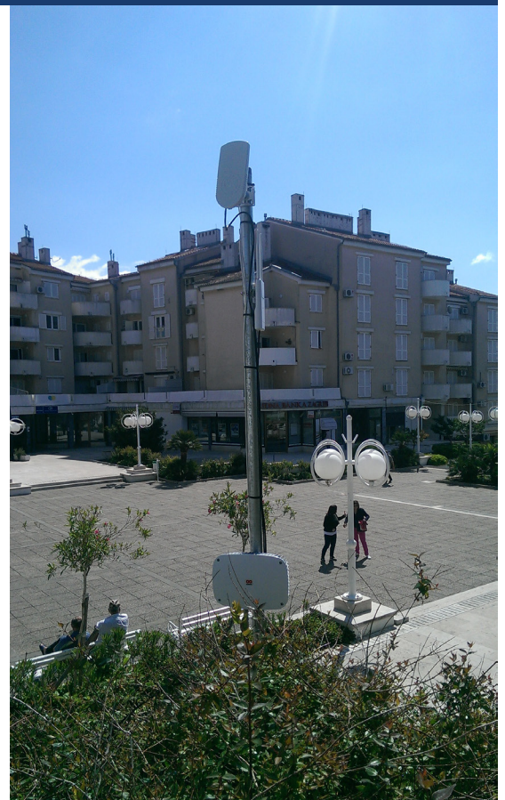
ePMP Subscriber Module connects a Public WiFi Access Point