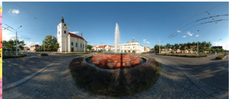
Lázně Bohdaneč city center