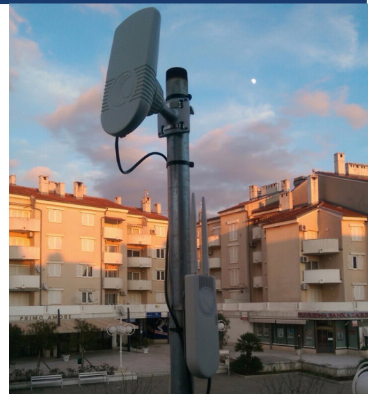
ePMP 1000 hotspot 2,4 GHz providing WiFi on the beach

C024095H221A - ePMP™ 1000 hotspot (EU, ROW, EU cord) 802.11n 2.4GHz WLAN AP; dipole Antennas, & Mounting bracket