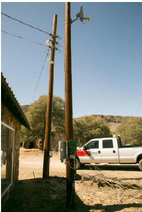
Subscriber Module at Customer Location