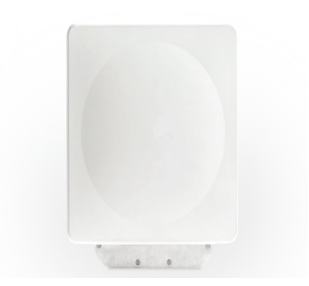
PTP 670 • 4.9-6.05 GHz RF Bands • up to 27 dBm • 250 km Range

ePMP Force 200 • 5 GHz • 25 dBi antenna • 5 | 10 | 20 | 40 MHz channel width